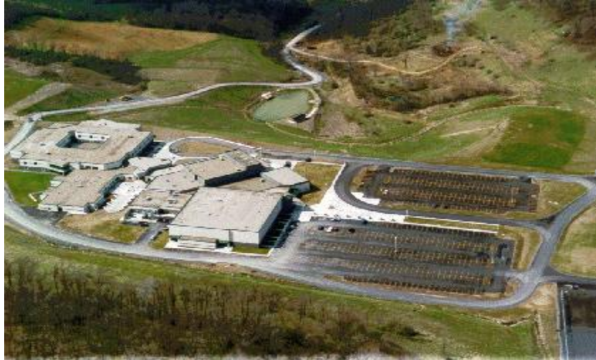
The Smoke indicates the beginning of construction for the new entrance road from Rt. 98 construction. This road is now fully completed.