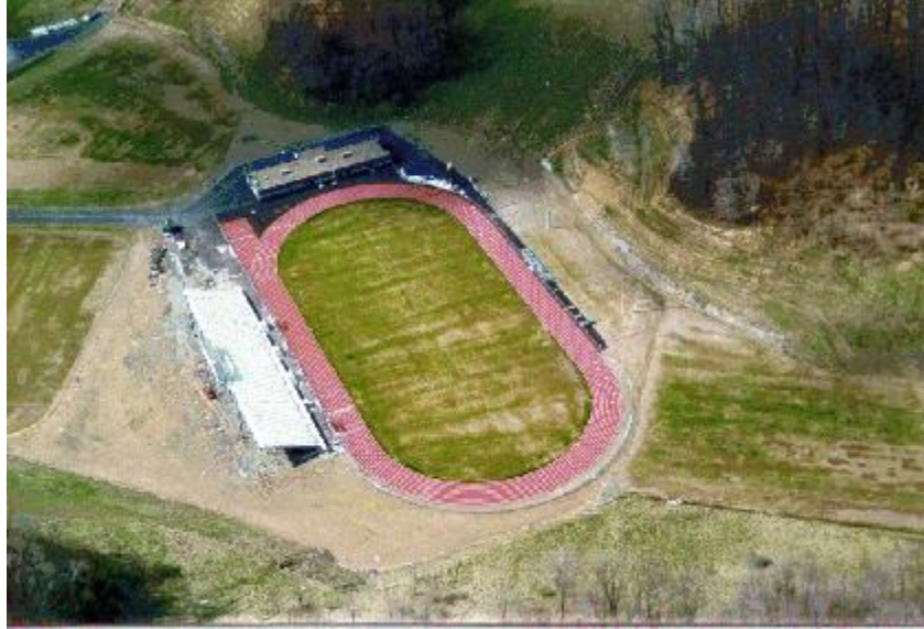
This picture again shows track and field prior to construction of the visitors seats, fencing and general landscaping.