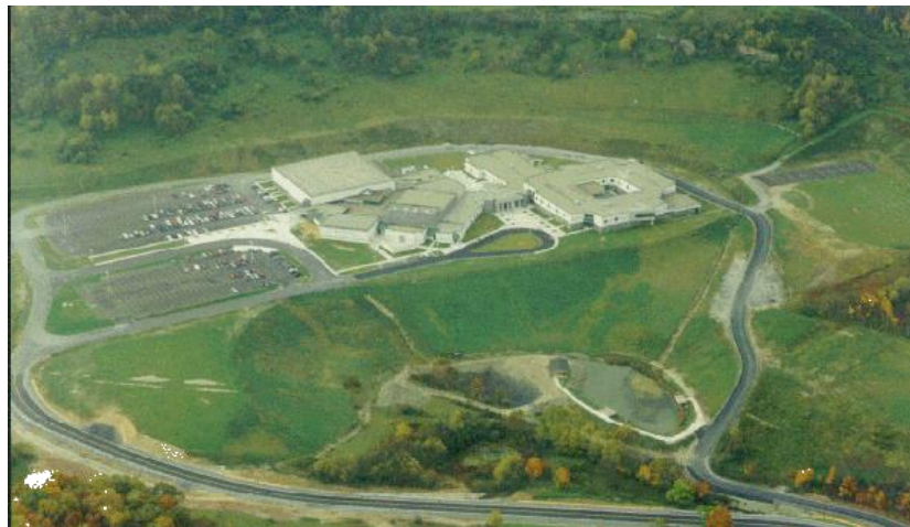
Aerial View of School with parking areas, band practice field(right), and environmental wetlands project. Football stadium, practice fields, soccer field, and baseball field,(under construction) left out of view.