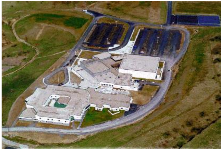
This is a picture of West side of building. All access to the building at the time of this picture was from the service road visible at the bottom of this picture.