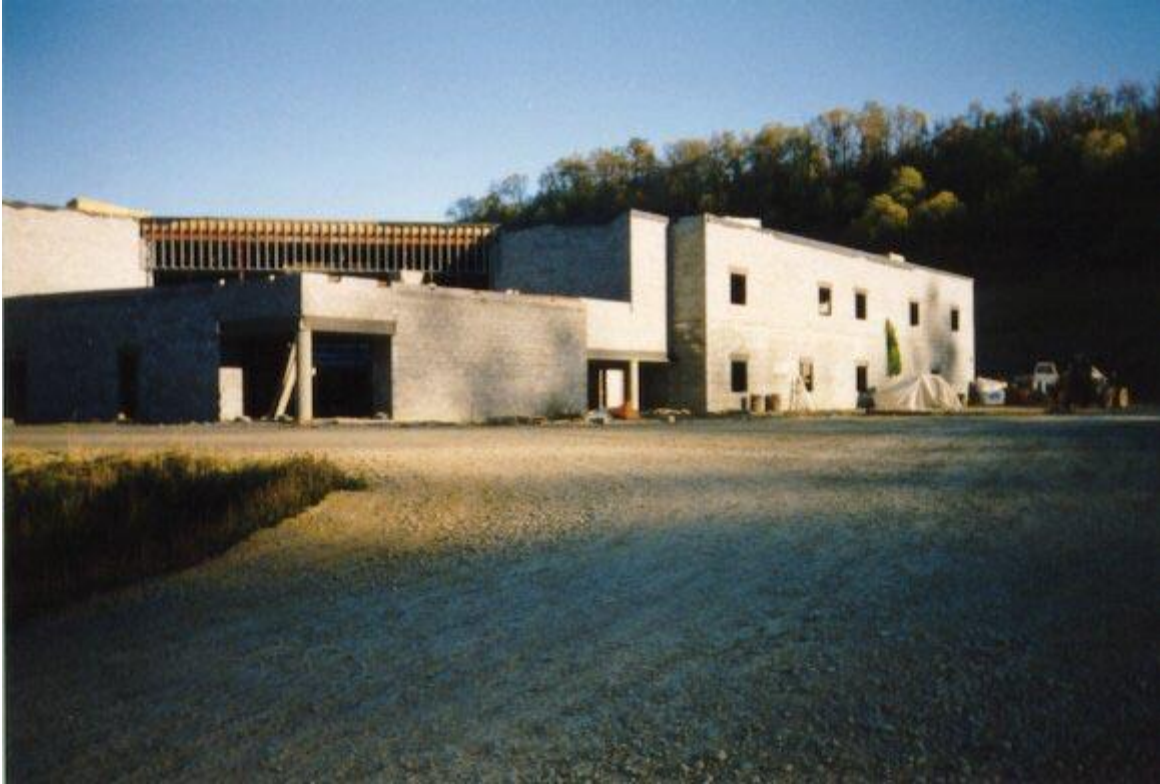
Academic Wing showing Media Center framing and entrance to Applications Technology classroom.