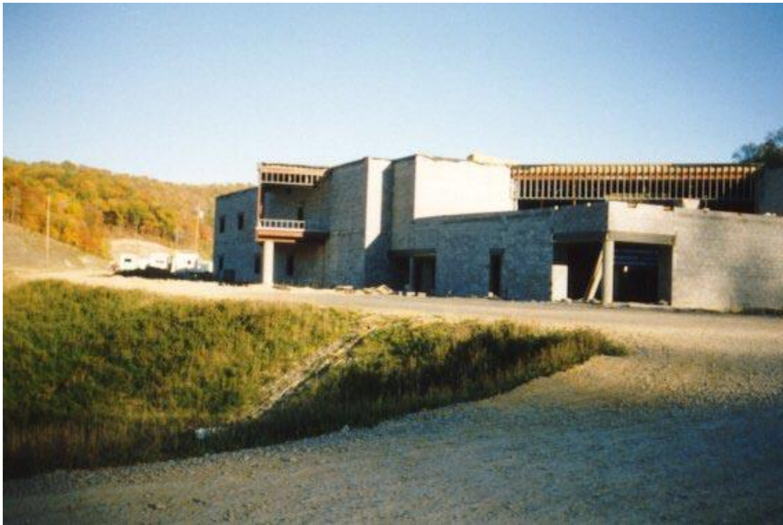
Southwest corner of building showing greenhouse protruding from side of the building. This is the Academic Wing with the Media Center framing shown center right. Construction trailers can be seen on left side of photo.