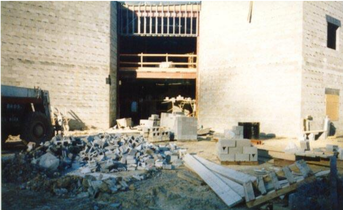
Entrance to Theatre/Band section of the building, located near visitor parking. Southeast corner of building.