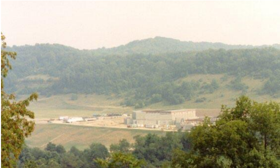
Gymnasium/Theatre with parking lots and sports fields not yet defined.