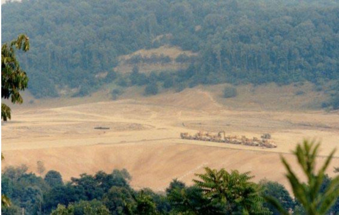
Site preparation required the moving and compacting millions of cubic feet of dirt to guard against subsidence.